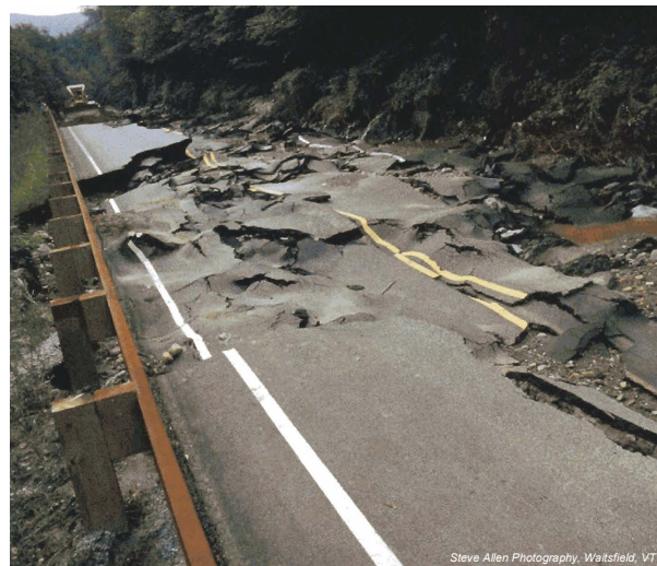
Road damage as a result of flash flooding.

When you approach a flooded road, TURN AROUND, DON'T DROWN!